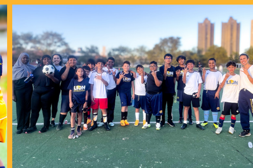
Middle School Soccer