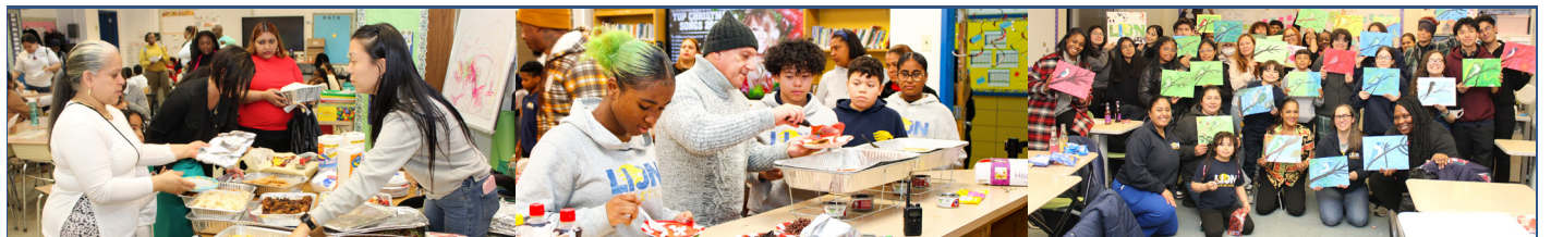
Elementary School families set up a beautiful spread for Hispanic/Latin Heritage Month.