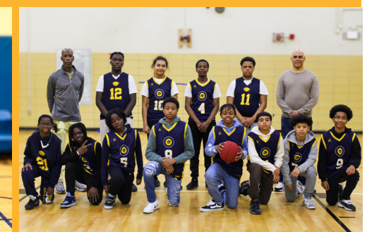
Middle School Boys Basketball