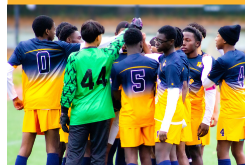
High School Soccer