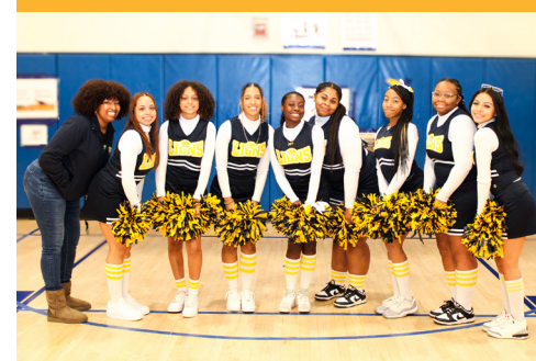
High School Cheerleading