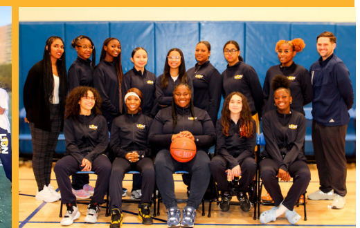
High School Girls Basketball