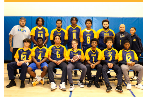
High School Flag Football