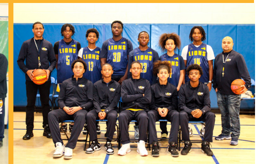
High School Boys Basketball