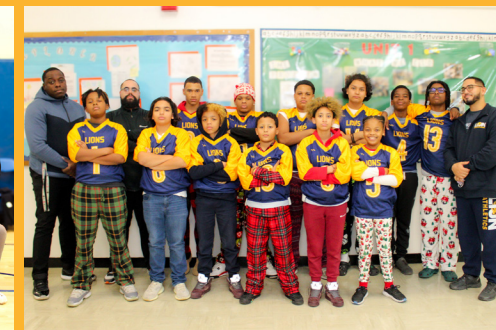
Middle School Flag Football