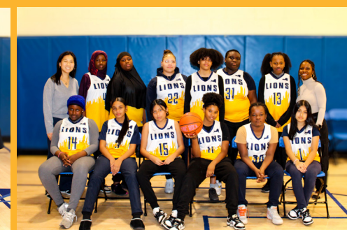
Middle School Girls Basketball